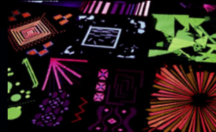
Gweithdai Fflwroleuadau, Fluorescent Workshops